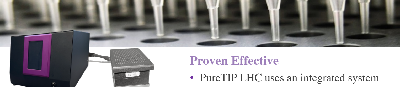
PureTIP LHC Components: PlasmaCharger Controller and Cleaning Station

96 and 384 format available to clean pipette tips 384 and 1536 format available to clean pin tools