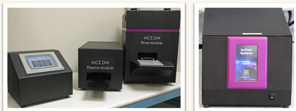
PurePLATE MCS Components: Plasma Module, Rinse Module, Communication Module and PlasmaCharger

PurePLATE MCS uses our patented plasma cleaning process to clean microplates for extended reuse allowing Pharma and Biotech labs to protect against shortages, achieve better science by reducing assay variation, and reduce environmental waste.